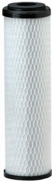
CG5-10S Replacement Cartridge: DEV9108-17